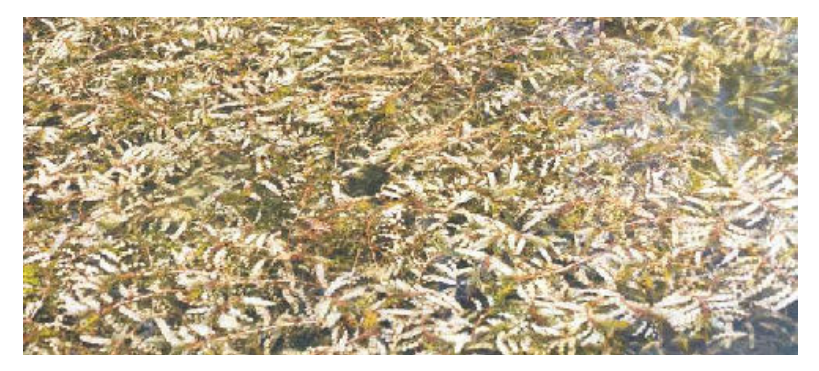
Very thick curly leaf matted on the water surface. Plants in the water may appear reddish brown but are actually green outside of water.